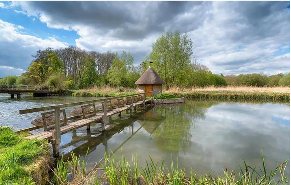
The beautiful Keyhaven, in Hampshire